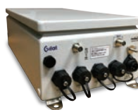
Capricorn Outdoor – All-weather satellite router