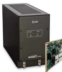
Taurus- Ultra-high-performance aero Modem