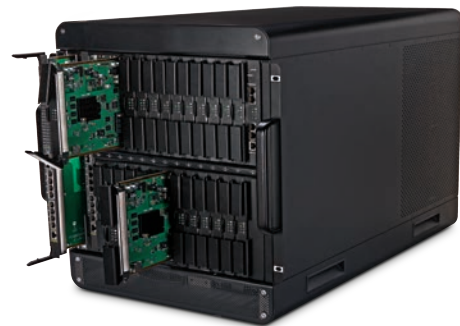
SkyEdge II-c System