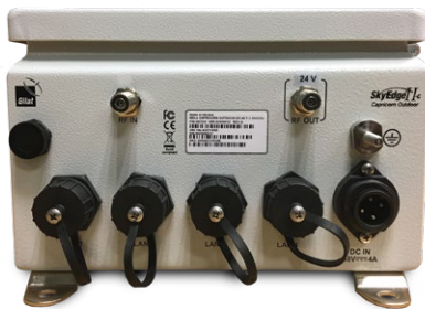
SkyEdge II-c Capricorn Outdoor

Requiring only hours to deploy per site, Gilat's solution allowed Sprint to rapidly and cost-effectively expand its network to new areas. Metro edge customers with 2G/3G service and limited data capabilities are now able to enjoy the benefits of true LTE over satellite performance. Using Gilat's satellite backhaul, Sprint can provide reliable, high-speed voice, data and video services on par with terrestrial performance. Equally important, Gilat's LTE satellite backhaul is comparable in cost to terrestrial solutions, with a lower TCO than microwave-based technologies.