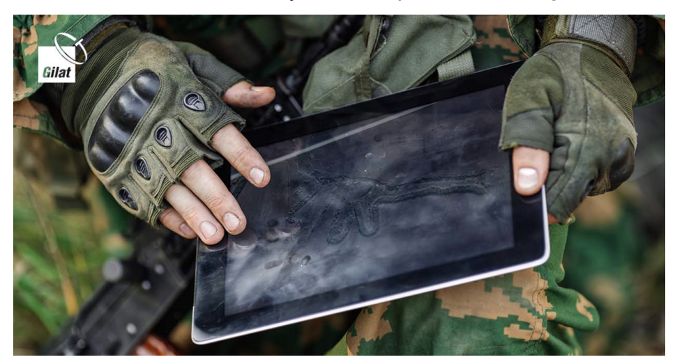
Security must be based on TRANSEC & FIPS standards

DataPath has more than 25 years of experience in integrated communications and information