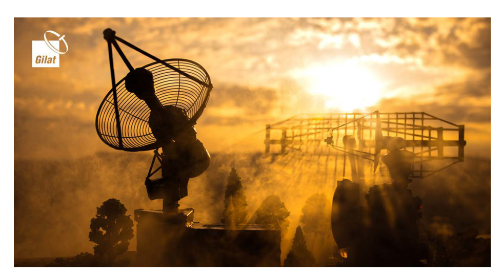
The U.S. DoD is already evaluating this SSPA for a significant SATCOM program. Once certified, Gilat expects follow-on orders valued at millions of dollars per year in the coming few years and the ability to pursue additional U.S. DoD and commercial programs.

The 500W Ka-Wideband Block Upconverter (BUC) covers military Ka- and commercial Ka-frequency bands and features hot-swappable components for a truly "always-on" satellite communication solution. Endurance is unique in its ability to replace existing SATCOM solutions currently serviced by Traveling Wave Tube Amplifiers (TWTAs).